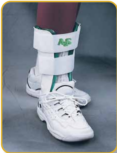
Product SKU: 0814 0622–0814 0624